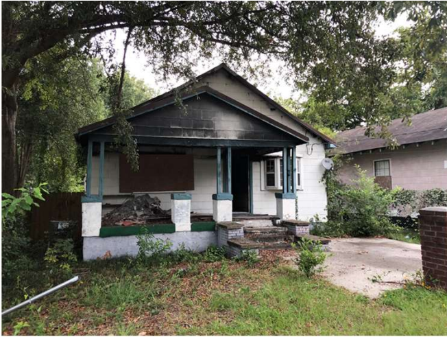
Removal of Blighted Properties