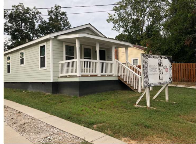
Development of New Housing Units