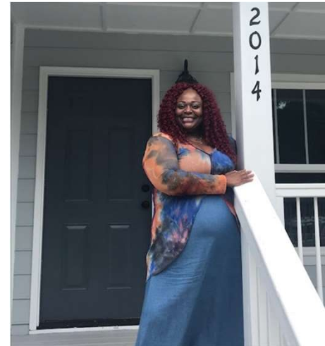
An Increase in Home Ownership