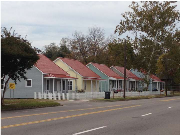
Rehabilitation of Existing Units